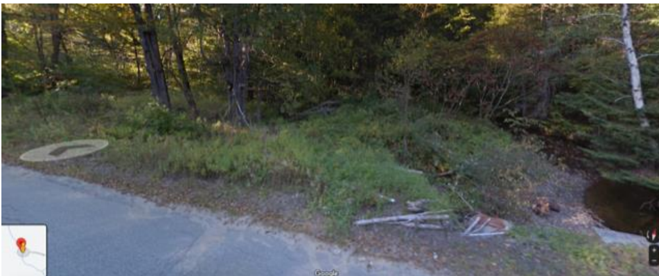
Image below- the arrow is the approximate entrance. Notice the stream culvert on far right of the picture. That is the edge of the property.