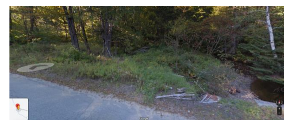
Image below- the arrow is the approximate entrance. Notice the stream culvert on far right of the picture. That is the edge of the property.